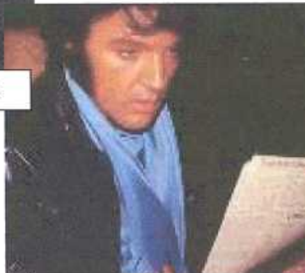
Nearing the end of his career