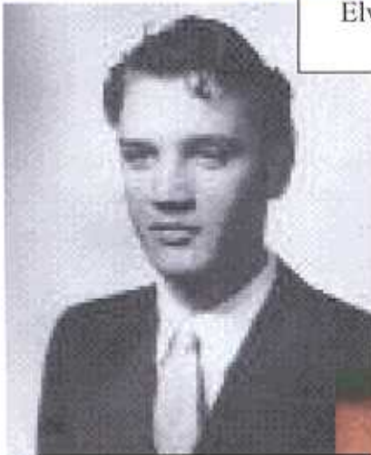
Elvis the Early Years