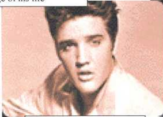
Elvis in his First Motion Picture