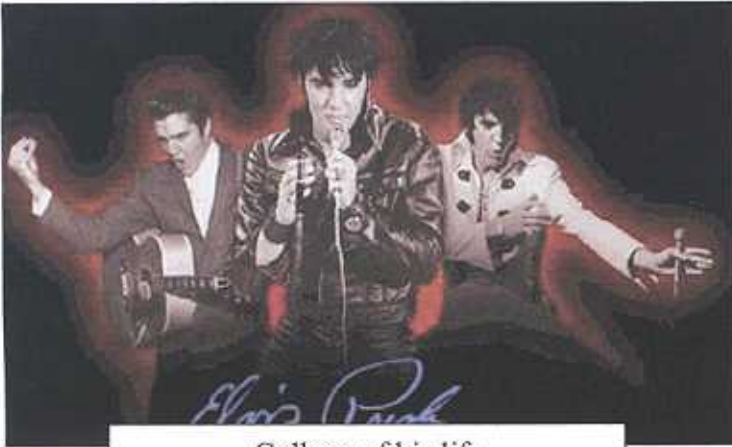
Collage of his life